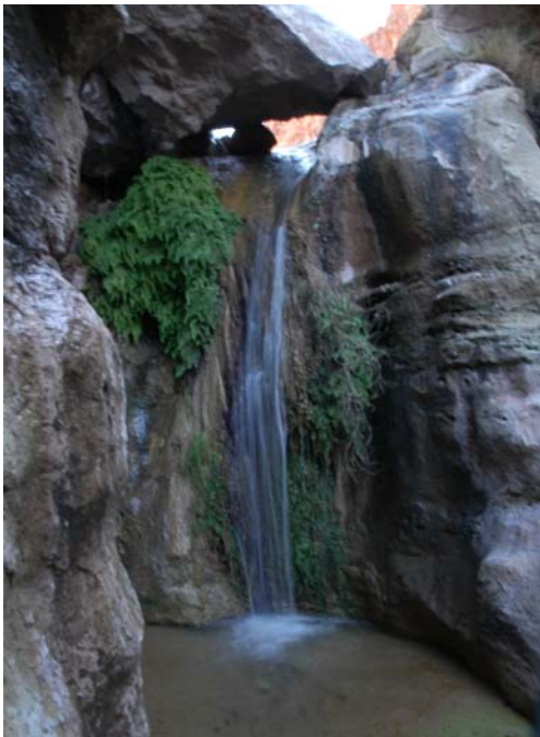
One of 2 Waterfalls that we saw on our January Big Bend trip!