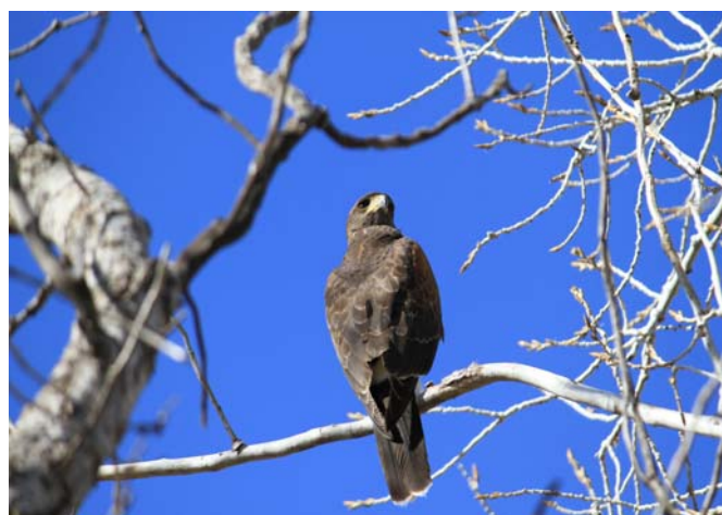
Hanging out at the pond....