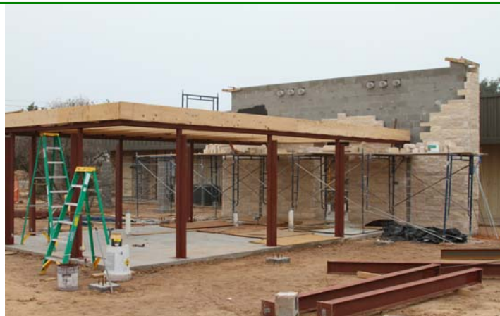
Wildlife Viewing Room in Back of Learning Center

Naturalists and the Permian Basin Outing Club on the weekends. Both venues are great vehicles to get out and progress your photographic skills and it all comes with your membership. We also have created a new wall to feature member photographs (if you will print them, we will display them). All photographs will be displayed for at least a month at Sibley so here's your chance to show off your skills.