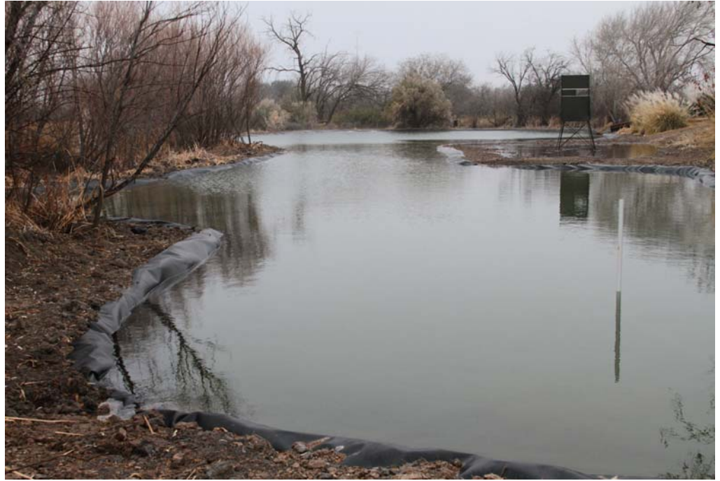
Widened, deepened, and newly lined Sibley Nature Trail Pond (still filling)

The Sibley Nature Center 1307 E. Wadley Midland, Texas 79705