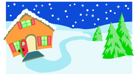
Have an absolutely wonderful Holiday Season!

If plans follow through as scheduled we will be having a dedication of the new Sibley Nature Center Trails Improvements on