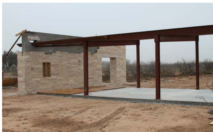
Outdoor Teaching Pavilion Northeast of Center