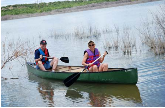
"I can row a boat.....canoe?" I'm sorry....I just had to.. R.G.