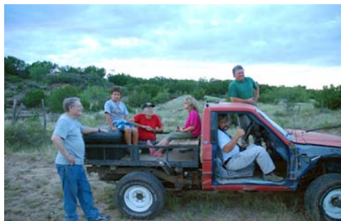
Take THAT Beverly Hillbillies!!

Remember!....we have a PBOC photo contest going. You can use any photos that you've taken over the 2007 PBOC Calendar year (that was taken on one of the trips). I've been working like crazy to find some mindless, useless, and inane prizes....guaranteed to bore or embarrass the winners! What other incentive could anyone need!