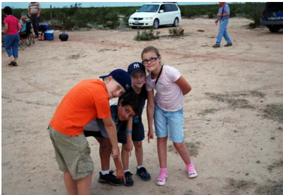
I don't know what they found but I'm sure they all see it!