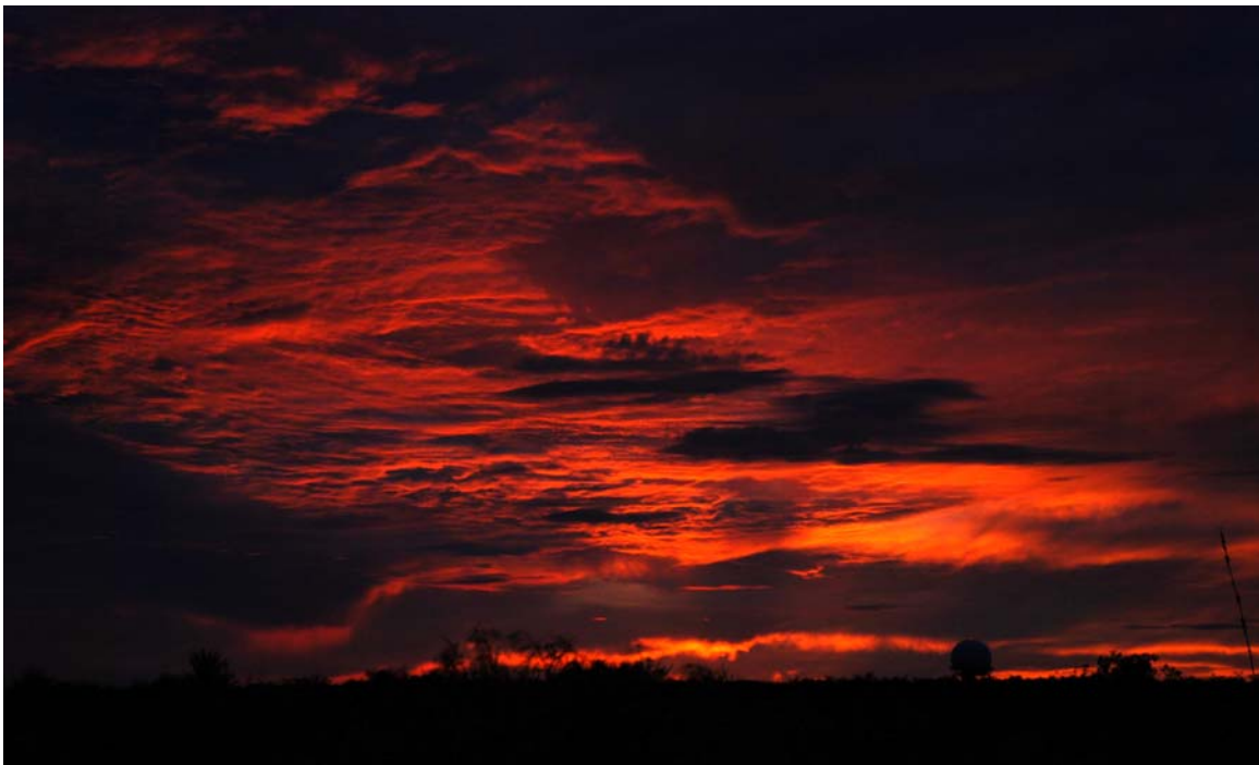
Sunset at Castle Gap.....this picture hasn't been manipulated in Photoshop...this is Mother Nature at work!!

We're on the web at: www.sibleynaturecenter.org