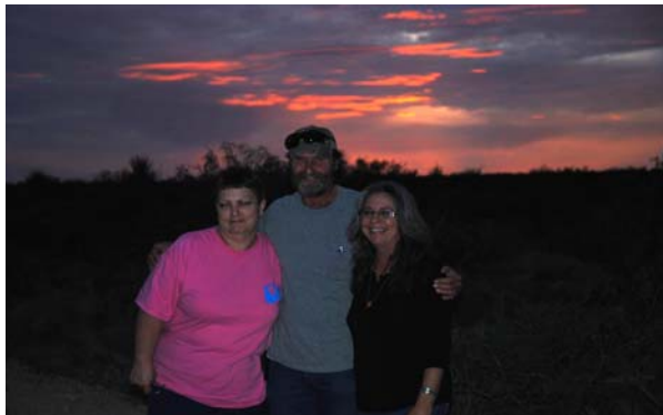
Happy trio!

"There is no greater joy than soaring high on the wings of your dreams, except maybe watching a dreamer who has nowhere to land except the ocean of reality."