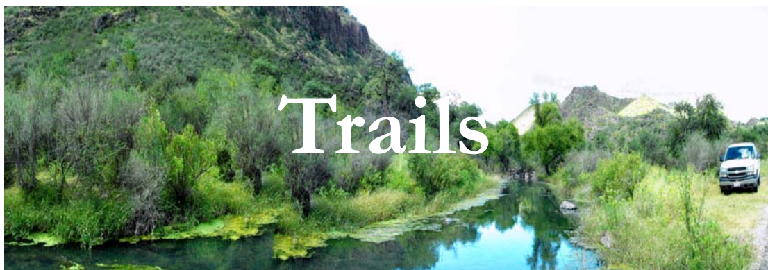
Panorama at Buffalo Trail Scout Ranch, Davis Mts.