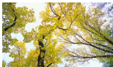
Pretty picture—photo by Bill Gates minions

As you should know, our November trip is to the Guadalupe Mountains National Park. Some of us will be camping at Parks Ranch, a primitive campsite (no potties, running water, hassles from authorities) and some may wish to camp at the Pine Springs campsite operated by the