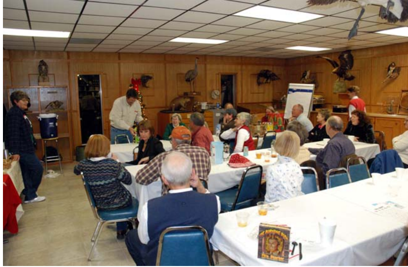
Some of the group.....the others are under the tables