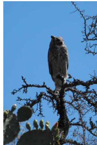
These two were neighbors and didn't get along at all!