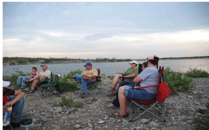
Some of the group