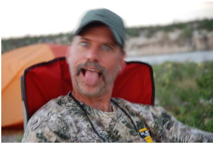
I'm sorry.....this is just wrong!