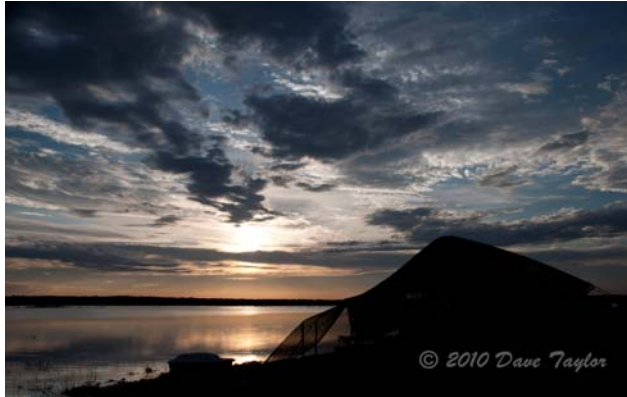
What can I say but wow!