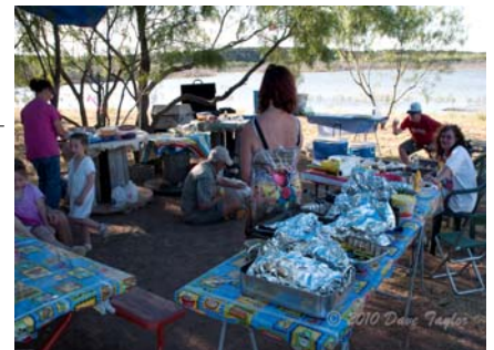
Time to feast....

“When the going gets tough, the tough get going. The smart left a long time ago.”