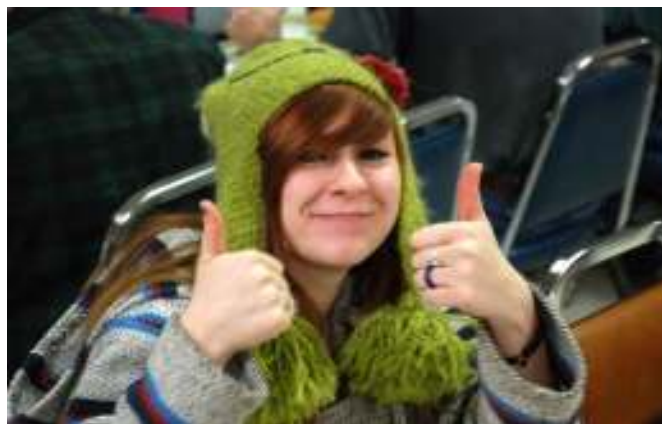
We had the heat on?