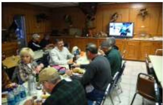
Eating we can do!