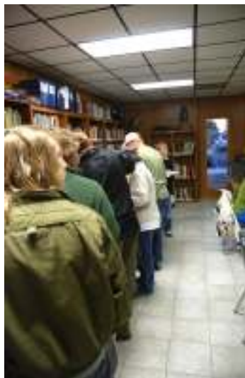
Cook it and they will come...

"A chicken crossing the road is poultry in motion."