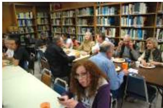
That same look every time.....