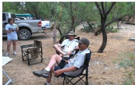
Notice who’s doing the work while the guys sit around?