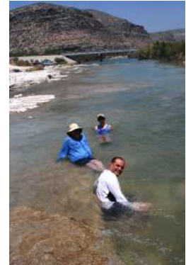
This is a place in the Pecos that you can actually wade in without fear of heavy metals, etc!

“Doing nothing is very hard to do. You never know when you’re finished”. - Leslie Nielsen