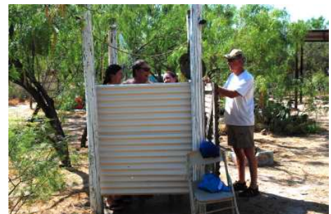
I was simply lifeguarding.....honest!